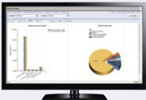
SIMATIC Information Server: Comfortable analysis and report generation