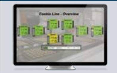
Important information at a glance at all times