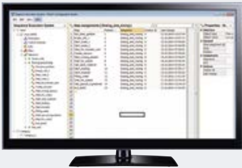
WinCC/SES: Efficiently process sequence-based recipes