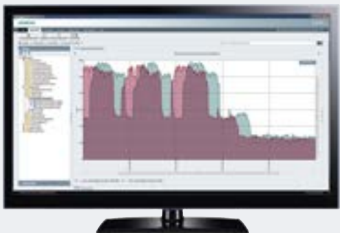
SIMATIC B.Data: Increased production transparency