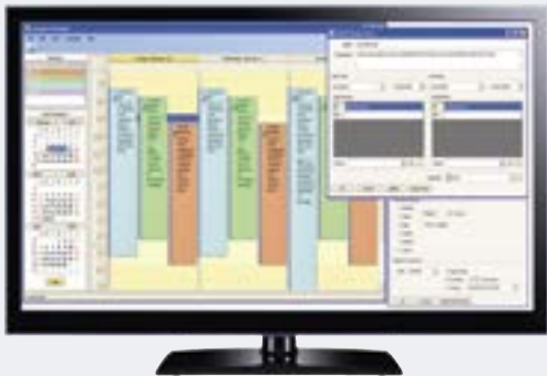
WinCC/CalendarScheduler: Planning of calendar-based events