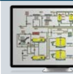
Efficient operations control